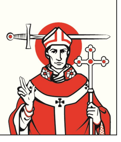
22nd September 2024