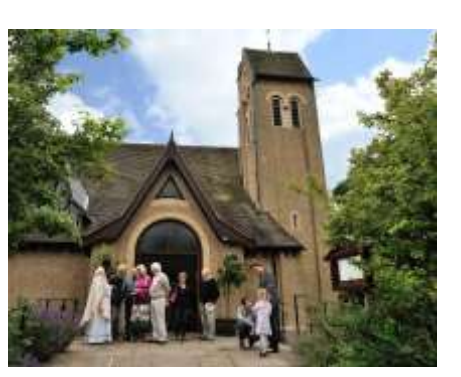
12 Granville Road, Sevenoaks TN13 1ER

Assistant Priests: Monday Parish Priest: Tuesday