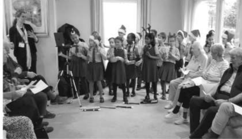
Service: children sing and play for residents of the care home